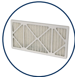
61-911F Disposable Outer Filter 12" x 24" x 1"